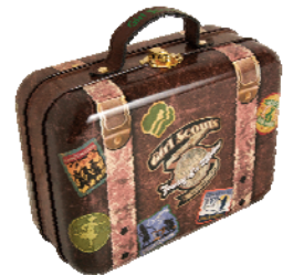
100th Anniversary Commemorative Tin