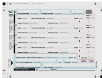
New Order Forms